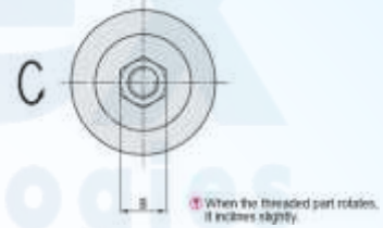
● Economy series Adjuster Heavy load type Dimensional drawing